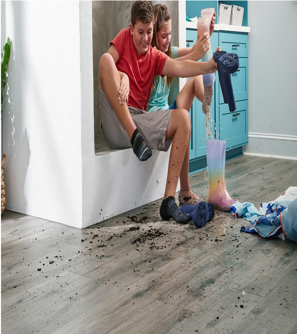
Weathered Grey Oak – Deko Extreme