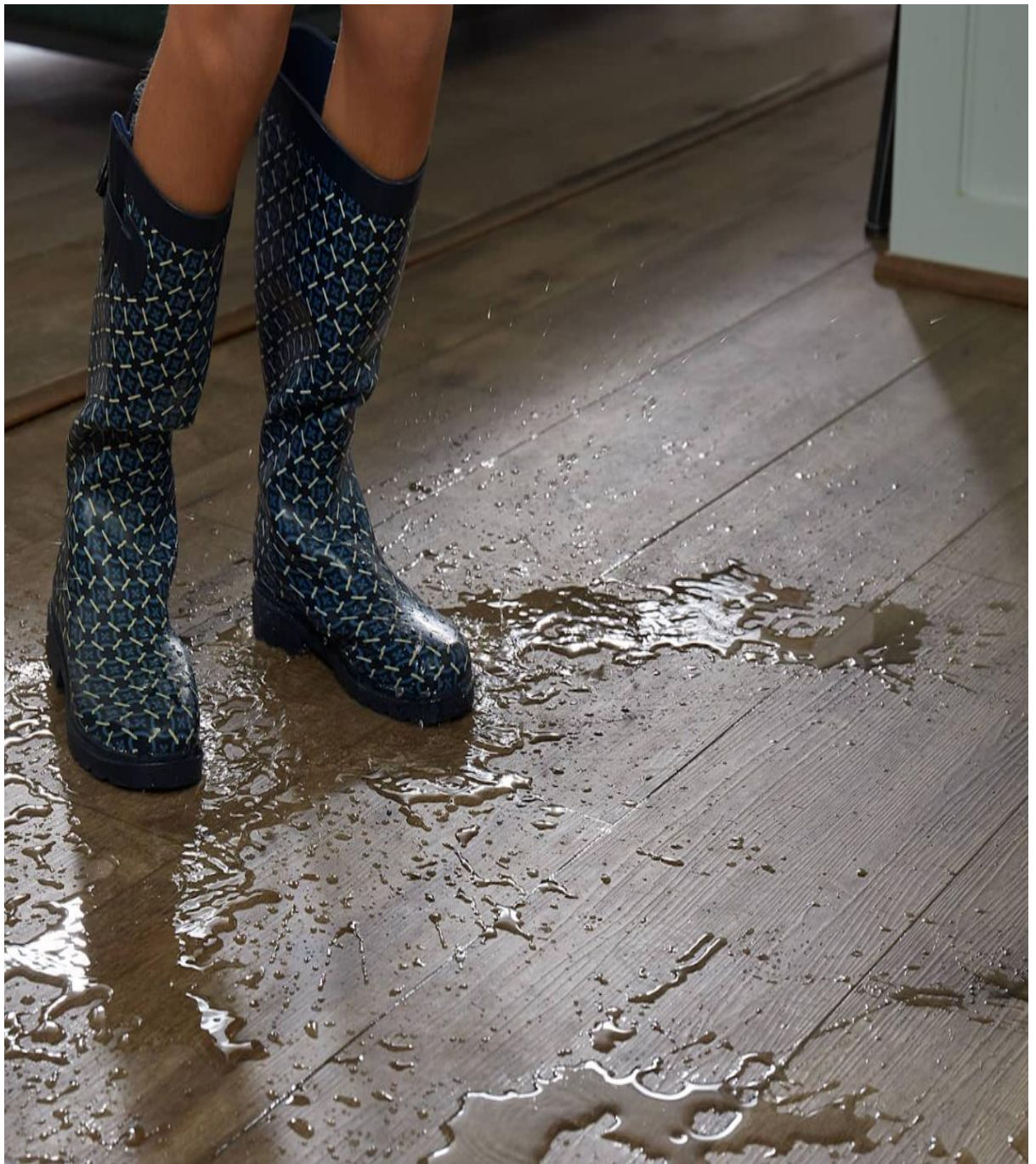
Iron Bark – Deko Extreme