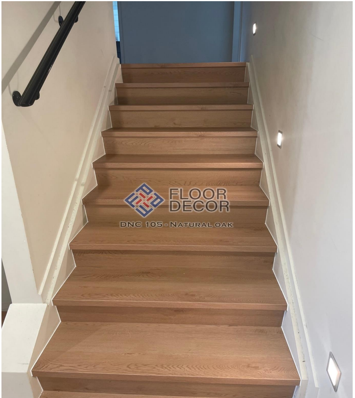
Natural Oak – Deko Extreme